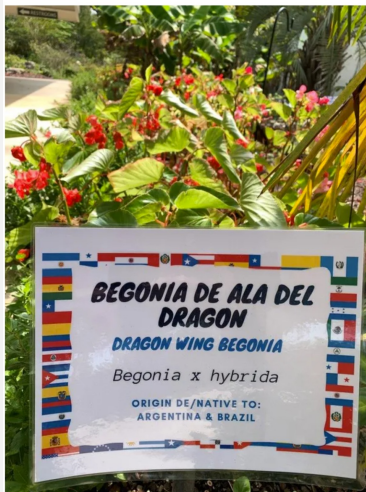
Dragon Wing Begonia is native to Latin America CONTRIBUTED PHOTO